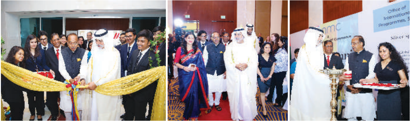
Inauguration of GMS at Dubai by His Excellency Sheikh Nahayan Mabarak Al Nahayan, and Sh. Vijay Goel