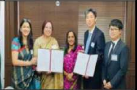
MOU SIGNING IN GEDU COLLEGE, BHTUAN, THAMMSAT UNIVERSITY, BANGKONK & KHU, SEOUL