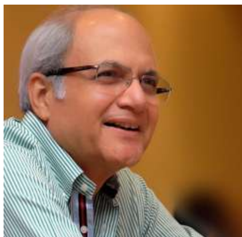
Dr. Ajai Chowdhry Founder-HCL, Founder Chairman- HCL Infosystems Ltd.