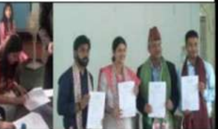
MOU SIGNING IN KELANIYA, SRI LANKA AND NEPAL