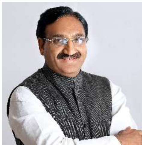
Shri Ramesh Pokhriyal Ministry of Education, India