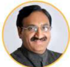
Shri. Ramesh Pokhriyal 'Nishank' Hon'ble Minister of Education, Government of India